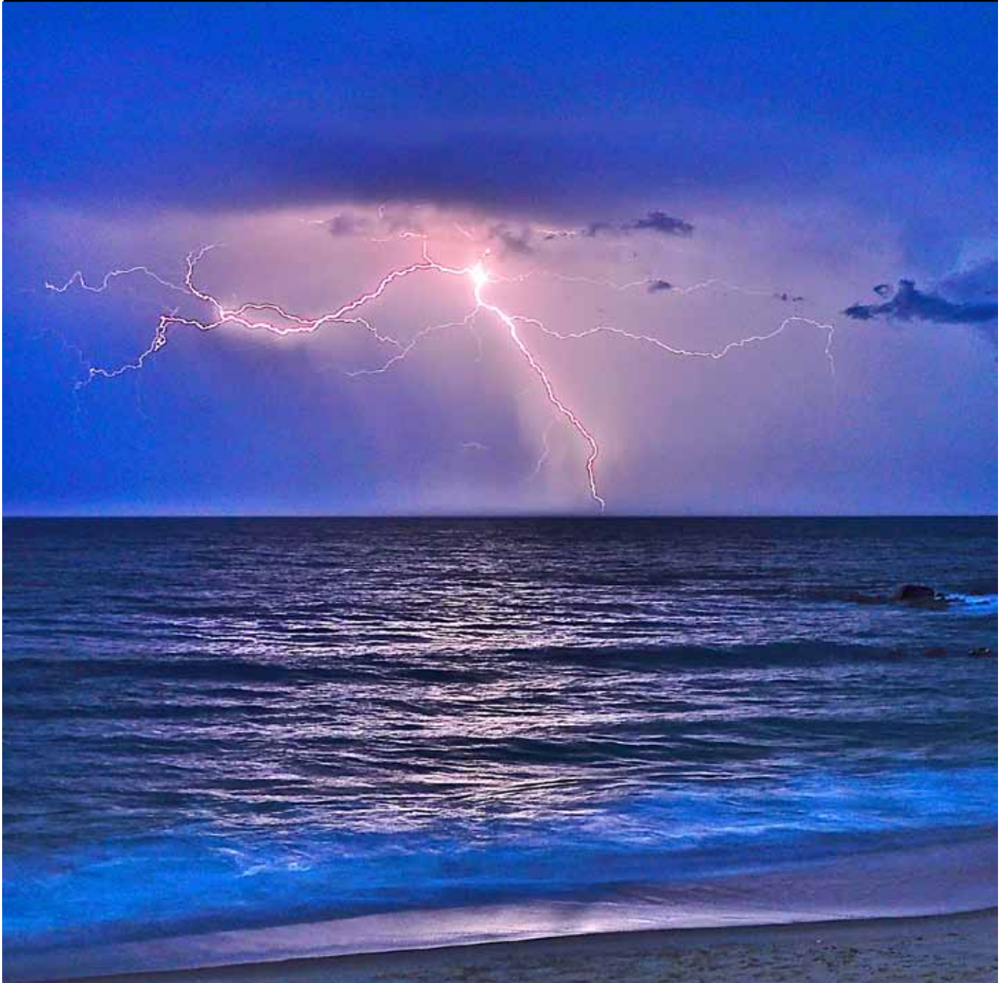
“Nature’s Spectacular Fireworks”