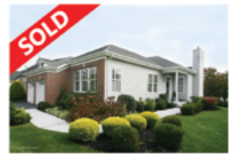
1547 Harvest Lane SOLD!