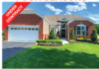
1549 Harvest Lane UNDER CONTRACT IN 3 DAYS!