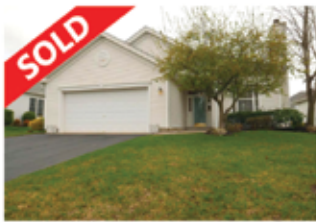
2516 Morningstar Road SOLD!